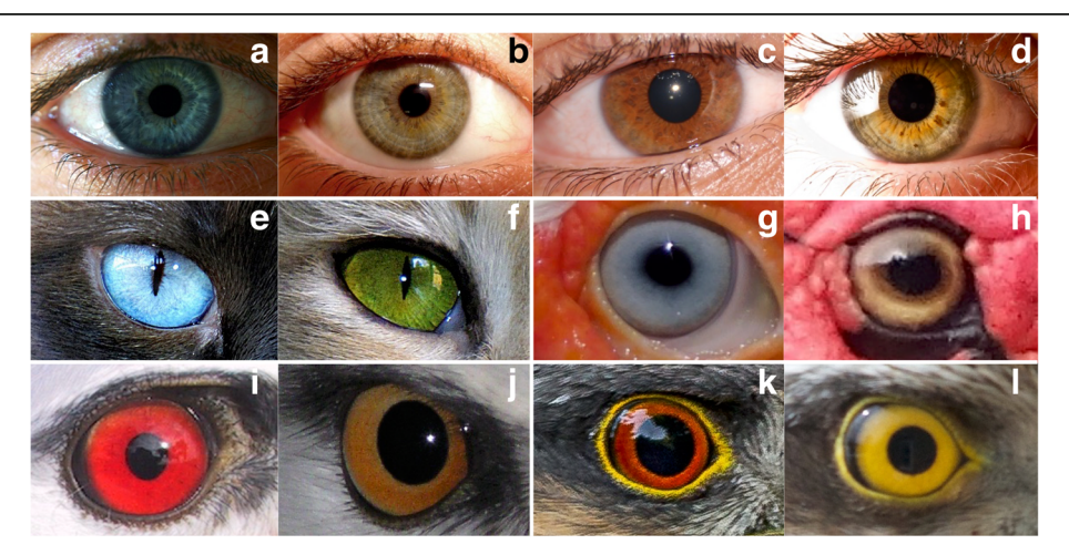
Fig. 1 Iris color varies continuously in humans from very light blue to dark brown (upper line, a , b , c , d ). Intrapopulational eye color variation is also characteristic of domestic animals (middle line): two adult cats Felis catus ( e , f ) and two adult domestic Muscovy ducks Cairina moschata domestica ( g , h ). In wild animals, however, iris color tends to be a fixed trait, with few observed variations due to maturation with age or sexual dichromatism. The bottom line shows color variation in two birds of prey. First a case of variation related to age in Black-winged kites Elanus caeruleus ( i : adult; j : juvenile). Second, variation related to sex: Sparrowhawk Accipiter nisus ( k : adult male; l : adult female). a : CC BY-SA 2.0 (https://creativecommons.org/licenses/by/sa/2.0/, Luisangel https://flic.kr/p/4vHKkh). b : CC BY 2.0 (https://creativecommons.org/licenses/by/2.0/, Gorgeous Eyes https://flic.kr/p/7vXh7G). c : CC BY 2.0 (https://creativecommons.org/licenses/by/2.0/, Jean-Simon Asselin https://flic.kr/p/2p4pFU). d : CC BY-SA 2.0 (https://creativecommons.org/licenses/by/sa/2.0/, Emilio Küffer https://flic.kr/p/agQvbv). e : CC BY 2.0 (https://creativecommons.org/licenses/by/2.0/, Trish Hamme https://flic.kr/p/e8v8ro). k : CC BY 2.0 (https://creativecommons.org/licenses/by/2.0/, Sighmanb https://flic.kr/p/ecc15G

In the scant literature on eye coloration in vertebrates, interspecific variation has been attributed not only to selection by the natural environment but also to predation pressure and sexual selection [5]. A study on more than 250 frog species in Madagascar found bright colored irises associated with tree frogs living in the forest canopy, whereas species with dark eyes would tend to be ground dwelling [13]. We know of no comparative studies for eye coloration of mammals, reptiles or fish. In birds, only two comparative studies have been published so far to our knowledge, both on passerines. One of them [14] reported an inexplicable higher proportion of bird species with bright irises in Southern Africa (25%) and Australia (35%) versus Canada (6%) and Europe (8%). The other study [5] reported that non-cavity nesting birds are under strong selection to evolve dark eyes, and that eye color was unrelated to parental care. At a general level, there is also the suggestion